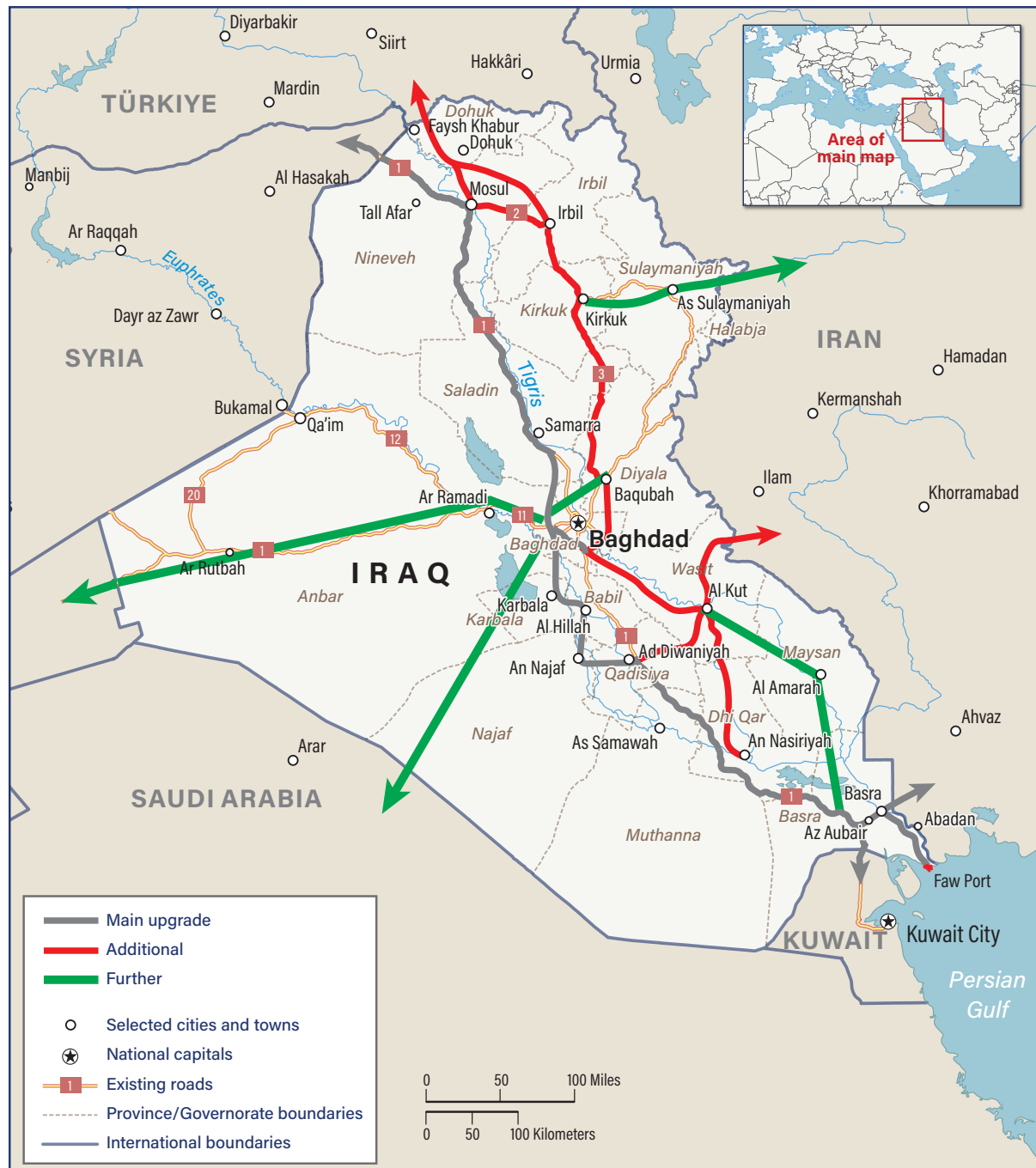
Map 2: Map Showing the Location of Faw Port