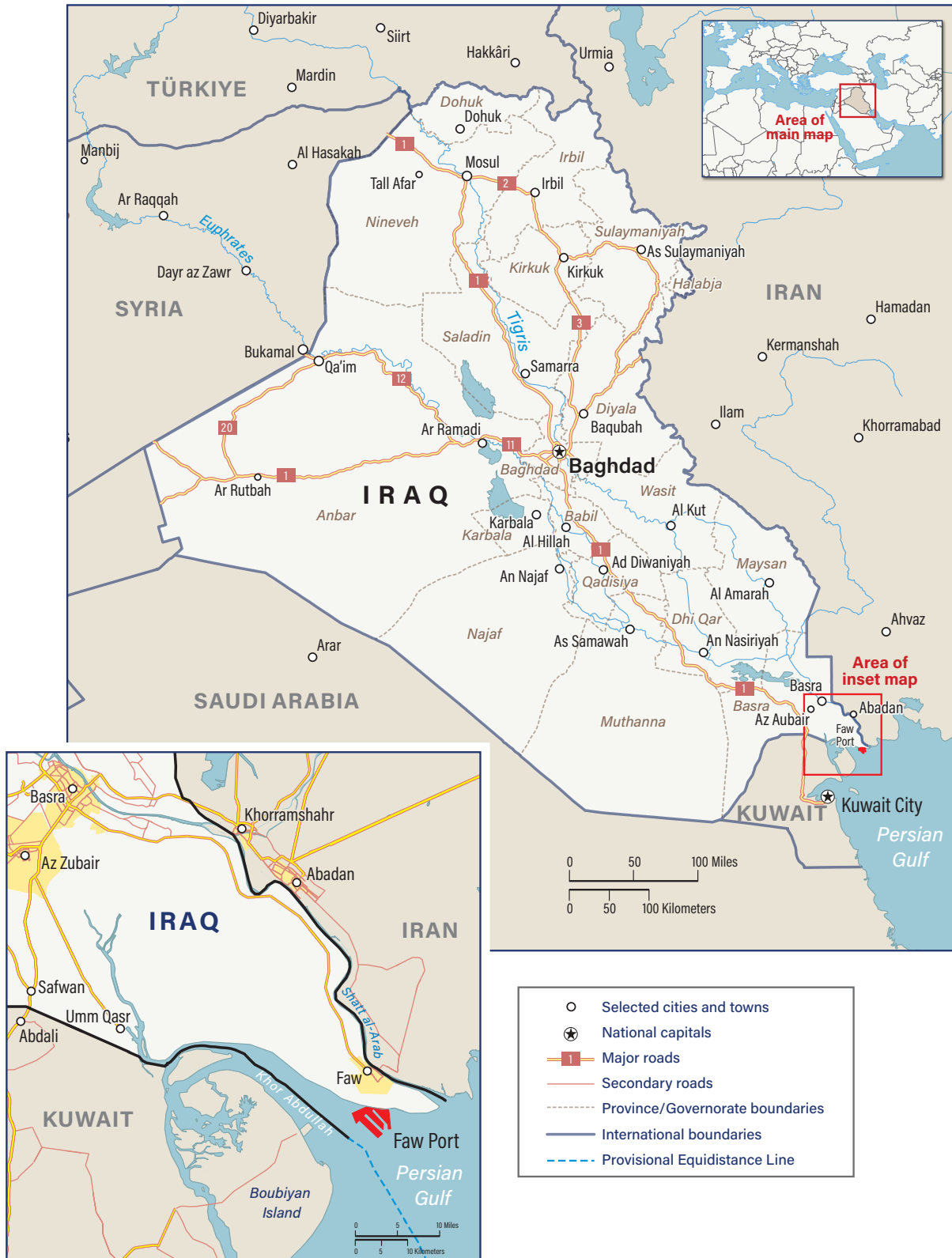
Map 1: The Development Road Project Plan by Iraq's Ministry of Transport