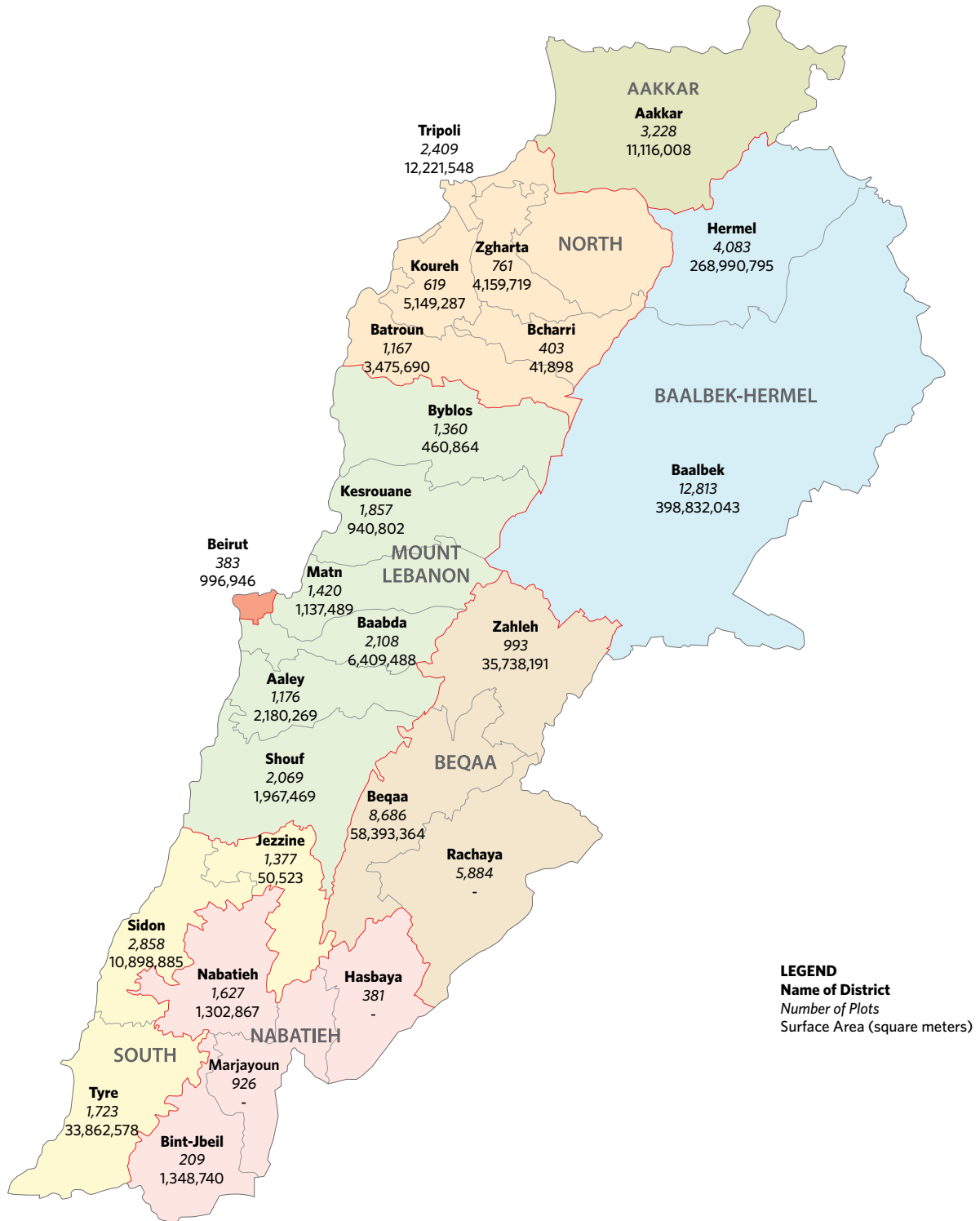
FIGURE 2 State Land in Lebanon's Eight Governorates (Plots and Surface Areas)

LEGEND Name of District Number of Plots Surface Area (square meters)